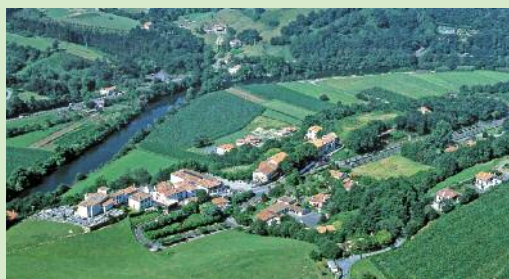
Aerial view of Biriadou

F rom the village of Biriadou, which is worth a visit in itself, this route sets out to tackle the Basque hills. In addition to the magnificent coastal views, you should come across pot-toks, sheep and griffon vultures.