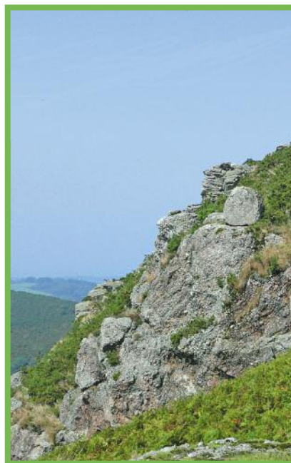
Rocher des Perdrix

sloping track offering some attractive views over the Bidassoa valley. Follow the signposts to the level of the power line 2 and turn left to return to the village. 2h30