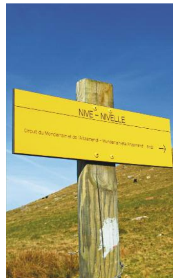
A local photo of footpath signposting

Walk times: The time taken to complete each route is given as a guide only, taking account of the length of the route, the change in altitude and any difficult aspects.