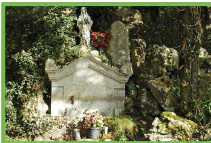
The way of the cross

9 0623090-4795644, you can admire the scenery and panoramic views, before beginning the descent back down towards the village.