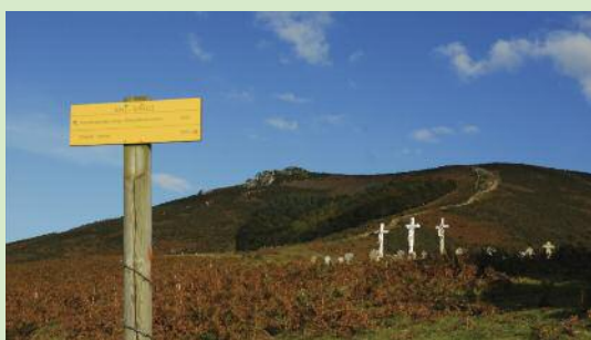
Panoramic view of the wayside crosses

A walk which offers magnificent views of the ocean, the surrounding mountains and Ainhoa, on several occasions.