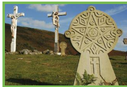
Disk-shaped steles at the Chapelle d'Aubépine

In the cemeteries of the Basque country, you may notice the beautiful disk-shaped steles. These steles are burial monuments which face East-West like the "etxea" (Basque house) and Roman churches. The carved components were crafted using ancient techniques and are unique to each stele, according to the inspiration of the engraver. This traditional Basque art was supplanted by marble and granite vaults, surmounted by crosses. Nowadays, the regional cemeteries contain many contemporary steles.