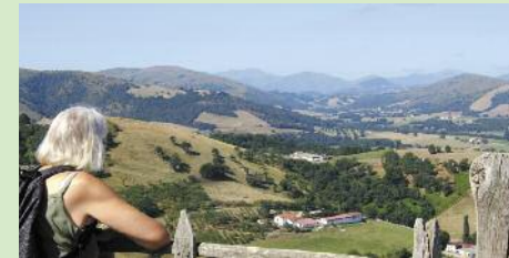
The view over the valley

A pleasant walk along the ridge of the village. The many fences that enclose crops have to be crossed using stiles («ateka»). Along the ridge, the walk looks out over the valley of the Bidouze and draws the sightseer's eye to the distant mountains of the Labourd. At the end of the itinerary, you can book a visit to the Larrondoia farm where they sell ewe's milk cheese and bottles of cider (sagarno).