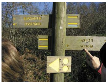
A photograph of local paths or signposts

Immense care has been taken when planning the suggested itineraries. We value your impressions and comments on the state of our routes because this enables us to maintain them in good order. Please do not hesitate to send us your comments by contacting the Basse Navarre tourist office at Saint-Palais on +33 559 657 178. You can obtain an Ecoville comments sheet from that office.