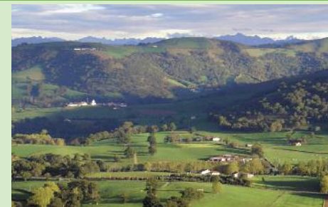
The Oztibarre valley

This walk offers the rambler the opportunity of discovering the entire Oztibarre valley at a glance. It takes you up to the top of Gazteluzahar which is an ancient protohistoric enclosure, a complex series of ramparts and earth fortifications. Once upon a time, it was the place where local populations took refuge and organized their defence.