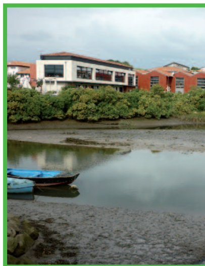
Untxin at low tide