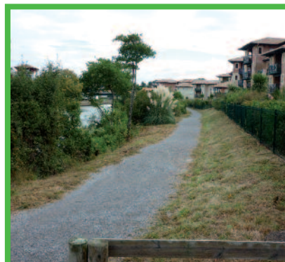
Promenade Pierre Larretche