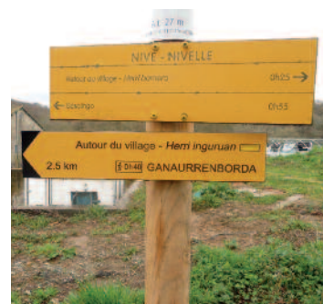
A local photo of footpath signposting

Walk times: The time taken to complete each route is given as a guide only, taking account of the length of the route, the change in altitude and any difficult aspects.