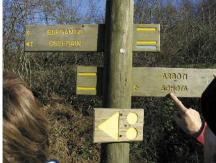
A photograph of local paths or signposts

Immense care has been taken when planning the suggested itineraries. We value your impressions and comments on the state of our routes because this enables us to maintain them in good order. Please do not hesitate to send us your comments by contacting the Basse Navarre tourist office at Saint-Palais on +33 559 657 178. You can obtain an Ecoveille comments sheet from that office.