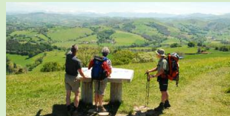
The viewpoint indicator

This Santiago itinerary rises up towards the Soiartz oratory. Ramblers and passing pilgrims can slake their thirst there, enjoy the view and the information stele that features the names of the mountain summits in the Basque and Bearn regions. On the way back, don't forget to stop off at the Halte de l'Escargot for light refreshment.