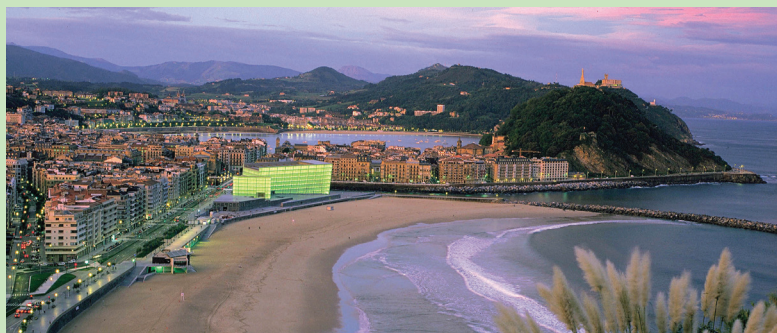
Donostia – San Sebastián