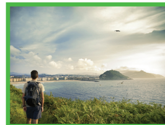
Donostia – San Sebastián