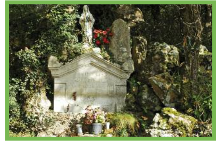
The way of the cross

route passes a single beech tree several metres further along. Continue until you reach the oratory, where you rejoin the GR<sup>®</sup>10. At the oratory 8 0623090-4795644 , you can admire the scenery and panoramic views, before beginning the descent back down to-