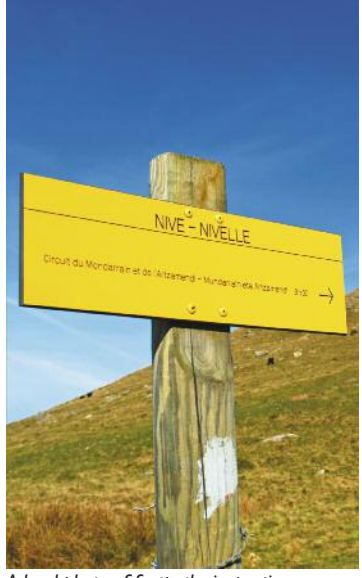
A local photo of footpath signposting