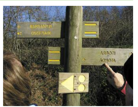
A photograph of local paths or signposts

Immense care has been taken when planning the suggested itineraries. We value your impressions and comments on the state of our routes because this enables us to maintain them in good order. Please do not hesitate to send us your comments by contacting the Basse Navarre tourist office at Saint-Palais on +33 559 657 178. You can obtain an Ecoveille comments sheet from that office.