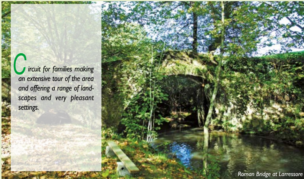
Roman Bridge at Larressore

C ircuit for families making an extensive tour of the area and offering a range of landscapes and very pleasant settings.