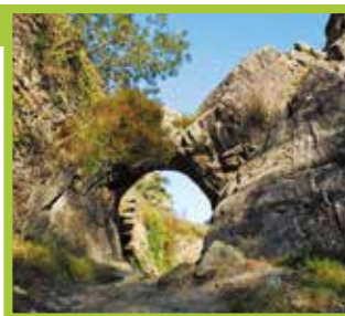
The Pas de Roland

Along a mule track follows the Ateka and Nive gorges, a narrow passage cut in the rock connects the valley to the border. Legends are attached to this and the passage has retained the name "Pas de Roland". According to some, Roland, the nephew of Charlemagne, came up against an impassable rock on his way to Roncevaux to fight the Saracens (in reality the Basques). His "Durandal" sword which never left him, allowed Roland to cut a passage for his soldiers who were thus able to continue their journey. According to other legends, this gap in the rock is the result of a kick from Roland's horse. Whichever legend you subscribe to, the beautiful scenery is worth the detour.