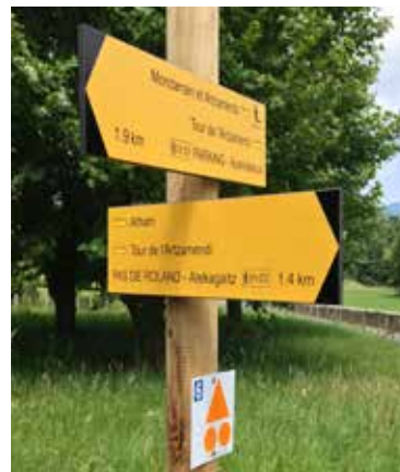
Hiking trails sign

GR ® (Grande Randonnée), GRP ® (Grande Randonnée de Pays) and PR ® (Promenade et Randonnée) are registered trademarks of the French Hiking Federation. Some routes have been selected by the Federation based on quality criteria, they are labelled PR ® .